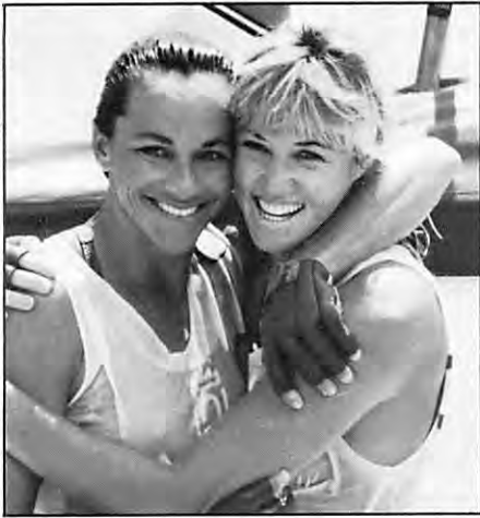
Pii Basdavanos and Muffer Scully congratulate each other on completing the grueling race.