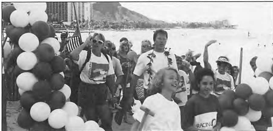
Chanting "We will, we will, rock you, OUT-RIG-GER!" paddlers marched from the Club to Waikiki Beach.