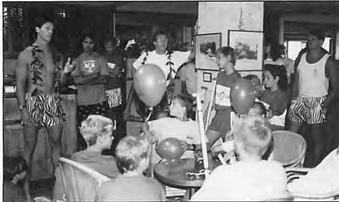
Paddlers gathered in the Bar for a pep talk before the Macfarlane Regatta.