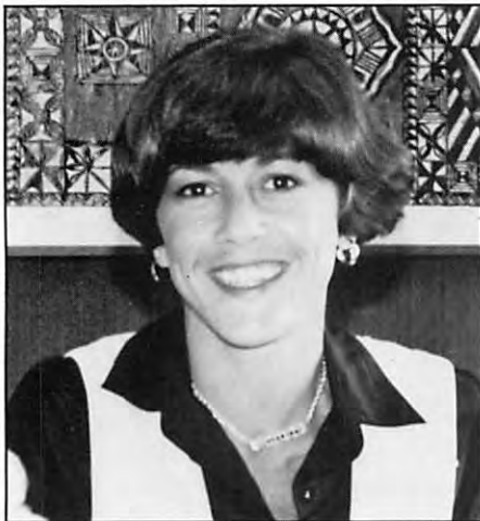
Scrappy Tannehill Entertainment