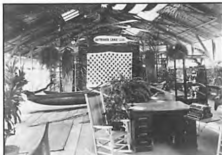
Interior of the clubhouse circa 1908.

The early Club house was two grass houses purchased from a defunct zoo and moved to the land leased by the Club next to the Moana Hotel's lagoon. One was fitted out as a storage shed for canoes and surfboards. The other, fronting on the beach, became the Club's first bathhouse and