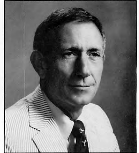
Chuck Swanson Building & Grounds