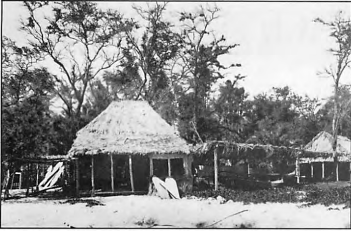
This grass shack housed the Club's canoes in 1908.