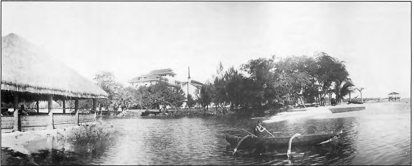
Viewed from the beach across the lagoon, the Club's earliest pavilion had a rustic charm of its own.