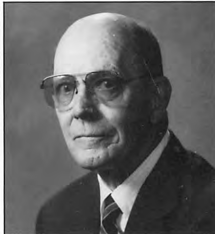
Reynolds Burkland Historical