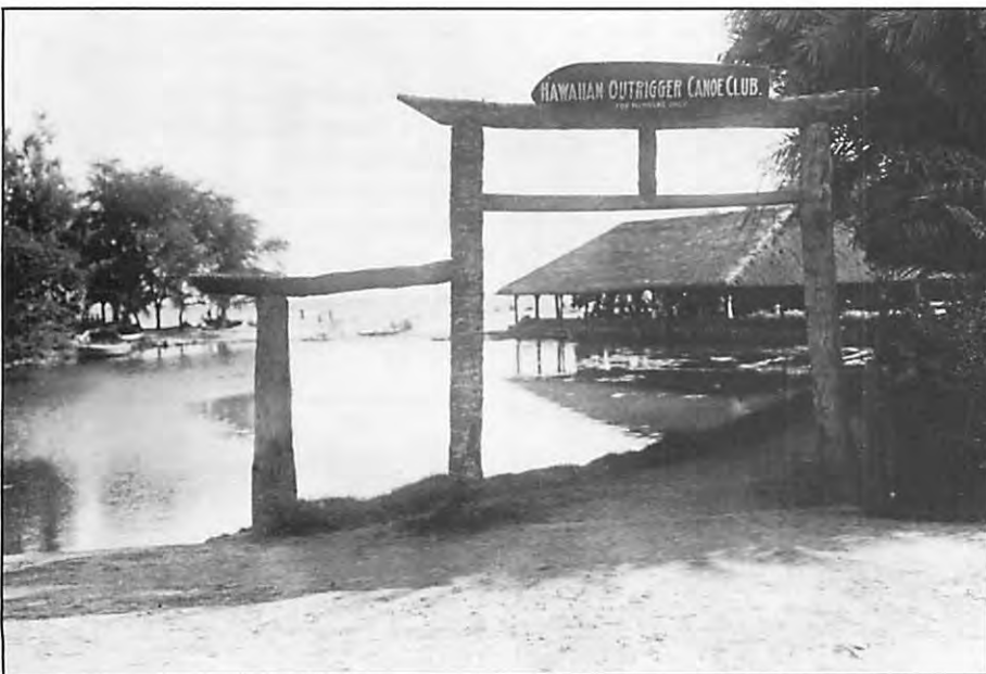
Gateway to the Hawaiian Outrigger Canoe Club grounds on Waikiki Road about 1910.