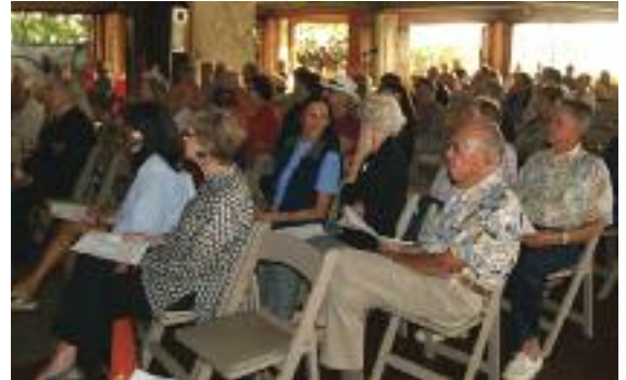
Members filled the Koa Lanai to listen to Club business.