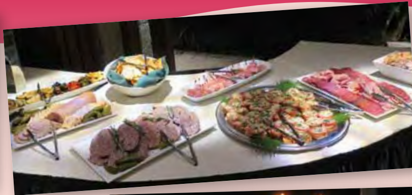
A yummy array of food was provided.