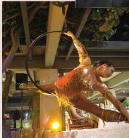
Dancers and casino games entertained members.