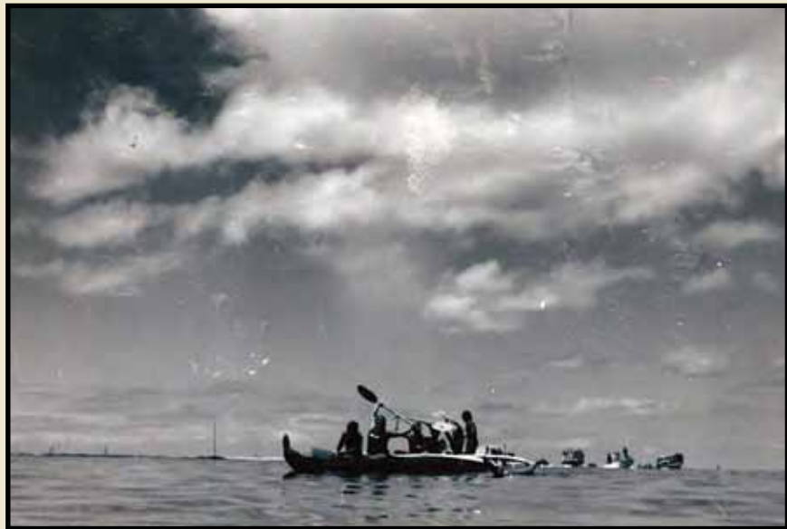
Outrigger leads paddlers to the finish line of the first Dad Center race.

The Kakina was then carried with reverence to the water's edge and lowered into the sea... she was home.