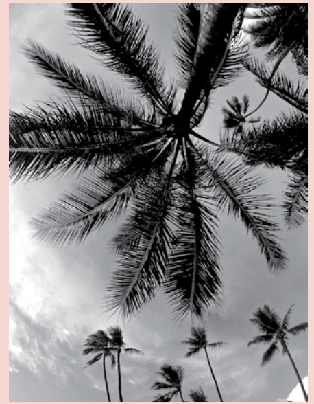
Black and White Ethan Bosworth Palms Darkest Hour