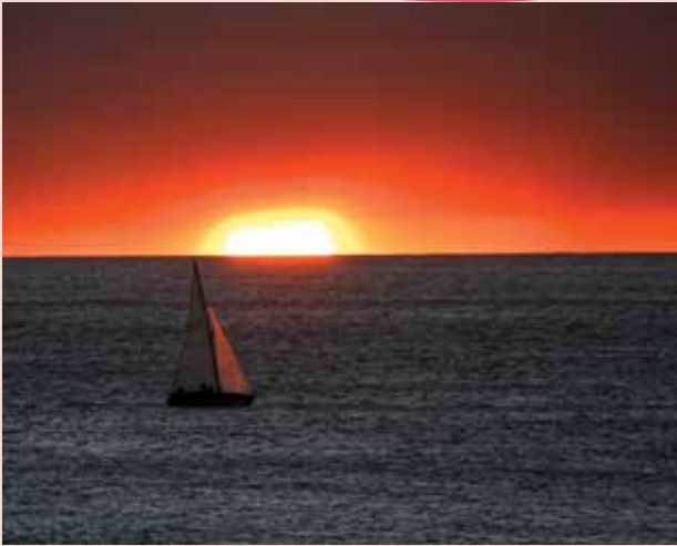
Creative (tie) Don Machado Solar Sail