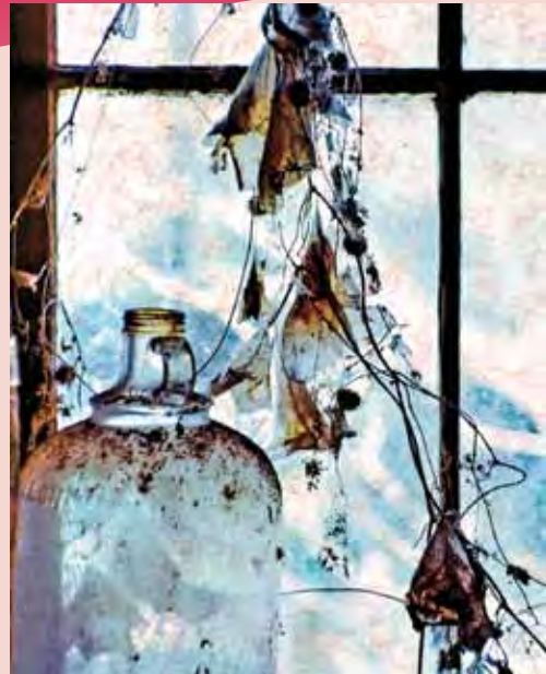
Creative (tie) Wakefield Ward Old Kula Barn