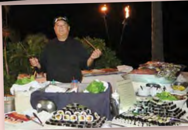
How else to welcome the new year but a sushi bar.