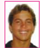
Kai Lenny Intermediate