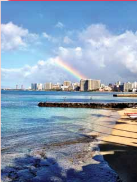
Clubscape Sherry Wong Just Another Day at the Club