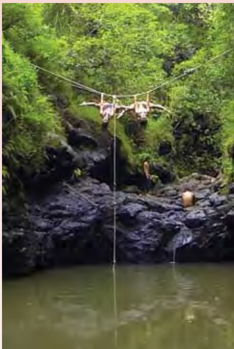
Sports/Activities Terri Needels Cirque de Manana Falls