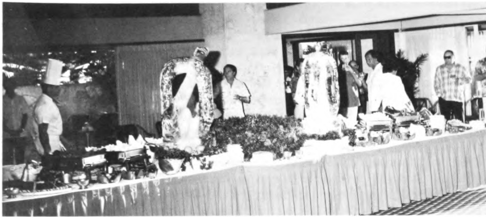
FESTIVE OCCASION — Some 225 people attended the President's Aloha cocktail party honoring all members who worked on committees throughout the year. The lavish buffet table is shown a few moments before the guests descended on it.