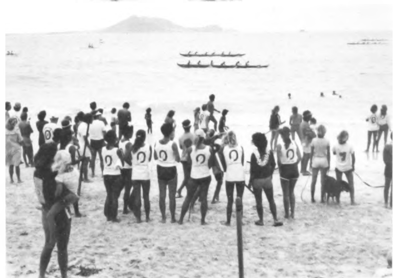
Part of the crowd of spectators at Waimanalo, including women paddlers (with Club T-shirts), presumably Women Novice B.