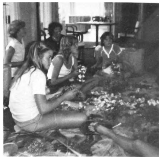
Outrigger girls making leis for members of winning race crews

On the following Sunday, June 17, again according to the Advertiser, Outrigger Club crews "won the first two events. . .and four out of the first six to take a commanding lead" in the Hawaiian Canoe Racing Association's Pop Waialeale Regatta at Waimanalo. "In all, Outrigger took seven first places to out-point Lanikai, 57-52 and take the championship." The Advertiser account did not list the winning crew members, but the events in which OCC crews were victorious were listed as: Boys B quarter mile; time: 3:22.6; Women's Novice A quarter mile; time: 2:47.6; Boys 14, quarter mile; 2:29.7; Men's Sophomore mile; time: 9:02.1; Men's Open half mile; time: 4:53.1; Women Masters quarter mile; time: 2:46.6. (No seventh event was listed, and it is possible that OCC crews took only six first places which, combined with four seconds and one third added up to 57 points; a fine record, either way.)