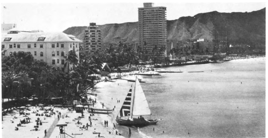
In the early 1960's, about 1963, Outrigger Beach at Waikiki (not Diamond Head!) looked like this. Really?