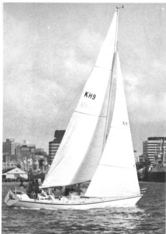
Uin-Na-Mara under sail