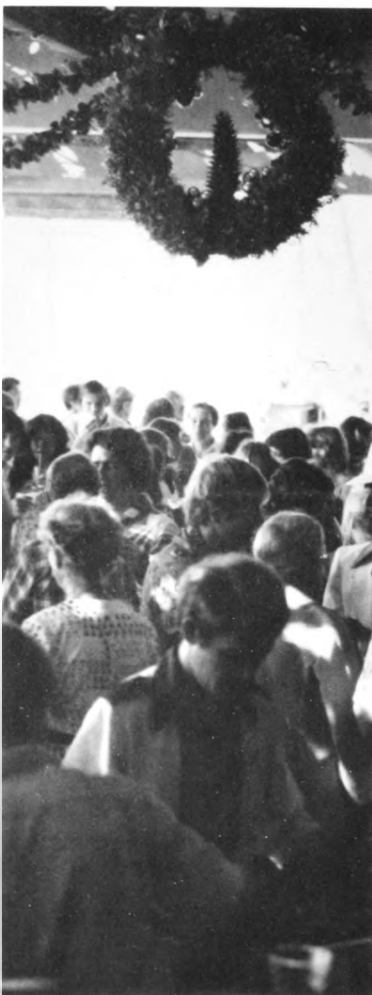
Part of the Open House crowd