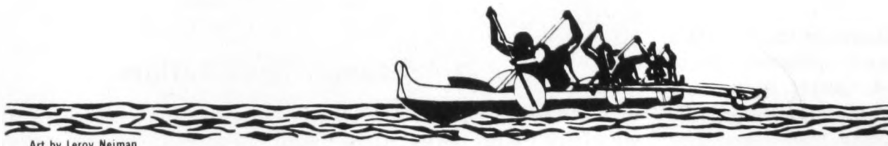
Art by Leroy Neiman

Beach attendants are on duty during daytime hours, 8:30 to 5:50 p.m. Upon request, OCC beach attendants will provide umbrellas in the sand court, and back rests as available. Surfboards are available at no cost to members and at a nominal fee for guests. Users assume full responsibility for damage or loss. Qualified members may sign for surfing canoes, the Club's small boats,