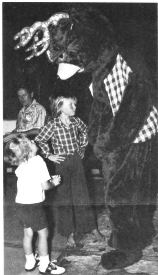
You see strange things at Keiki Parties.