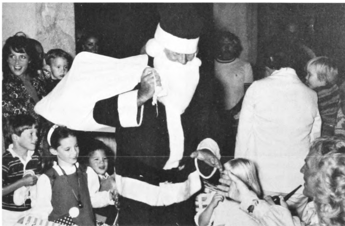
But when Santa arrives, as he always does for OCC keikis, everything else is soon forgotten.