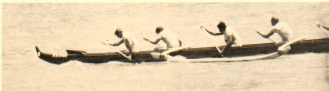
Senior Men crossing finish line at Kailua, Kona before an appreciative Kailua audience on shore