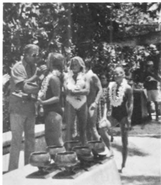
Tennessee Ernie Ford makes the awards after the race.

Outrigger and Hui Nalu. The two canoes were paddling for several miles close on and occasionally running into one another until Outrigger broke away and got into clear water. Once in the clear, the OCC crew continued to widen its lead, passing within inches of the cliffs below Makapuu light. Once around the bend, the OCC crew was never again challenged for its first place position. In the last miles of the race the closest challenger, Waikiki Surf Club, took the inside passage from Diamond Head past Tonggs in a vain attempt to get by Outrigger which had chosen the outside route. OCC quickly covered this move, came inside, made a beautiful and dramatic pass by the Club Beach and went on to the Natatorium for the win.