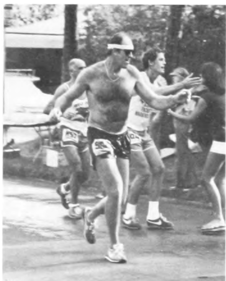
Hugh Foster Photo Scoop.