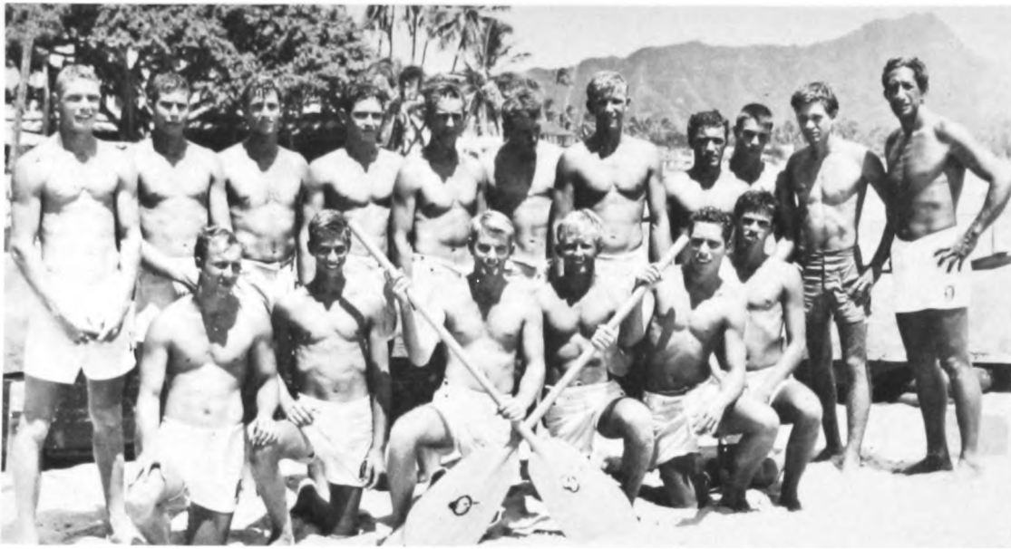
Canoe Racing and Regatta Season is once more upon us, and above we give you a crew from bygone days: 1949. See how many you recognize. (For names, see bottom of col 3, page 7.)