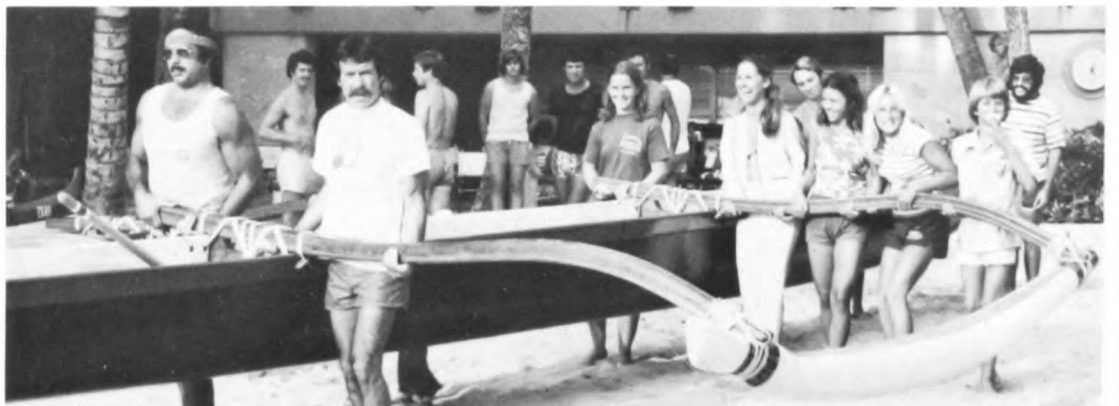
Some 27 years after the '49 crew did its stuff, a group of young paddling aspirants prepare to launch the Club's new training canoe "Kaiholo".