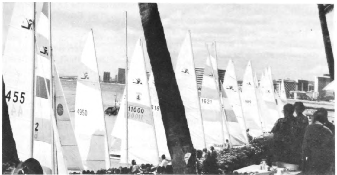
A small fleet of 'cats awaits signal to go on Outrigger beach