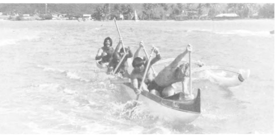
Conner's stalwarts heading into the channel.