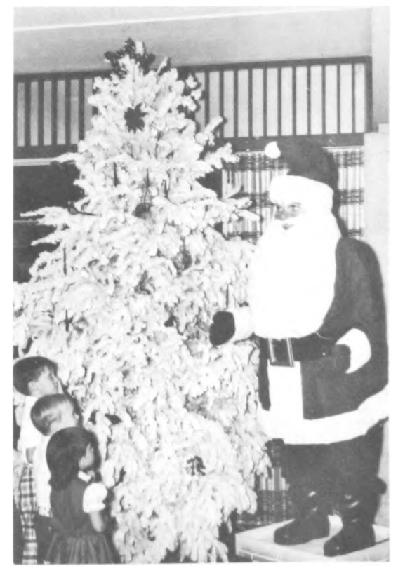
Santa Claus was an Outrigger lobbyist last Christmas. To keikis, he bows.