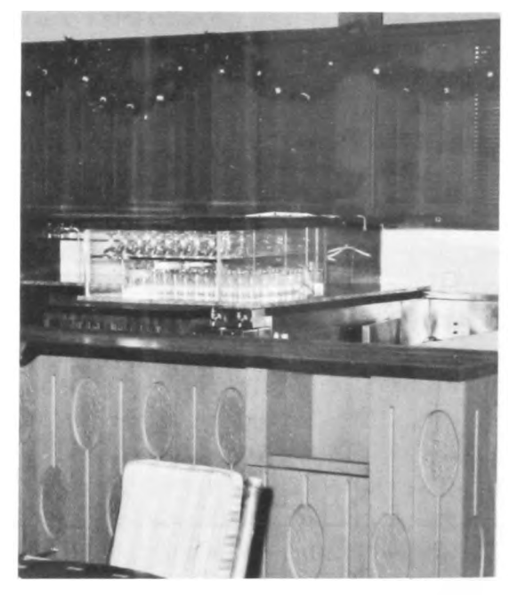
New bar with paddle motif.

Completion of the new Hau Terrace service stand creates a close "staging" area for waiters, waitresses, and busboys serving on the Hau Terrace.