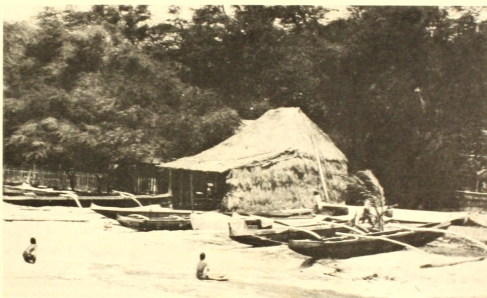
The Outrigger Canoe Club as it was . . . circa 1908