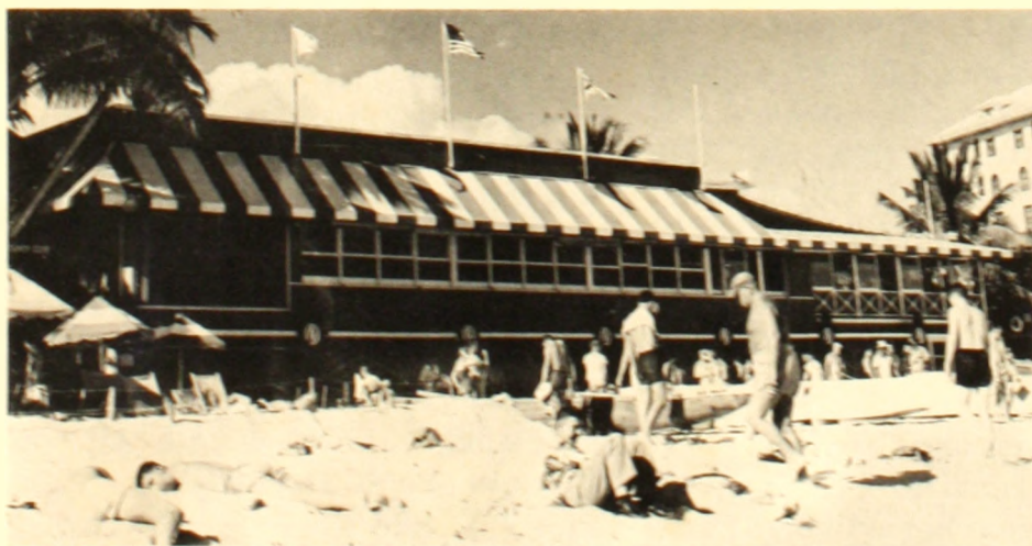
... and half a century later, circa 1958