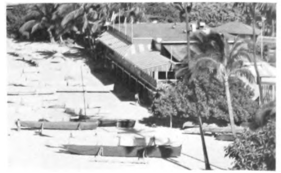
Another view of the clubhouse in the 1950's, from the diamondhead side