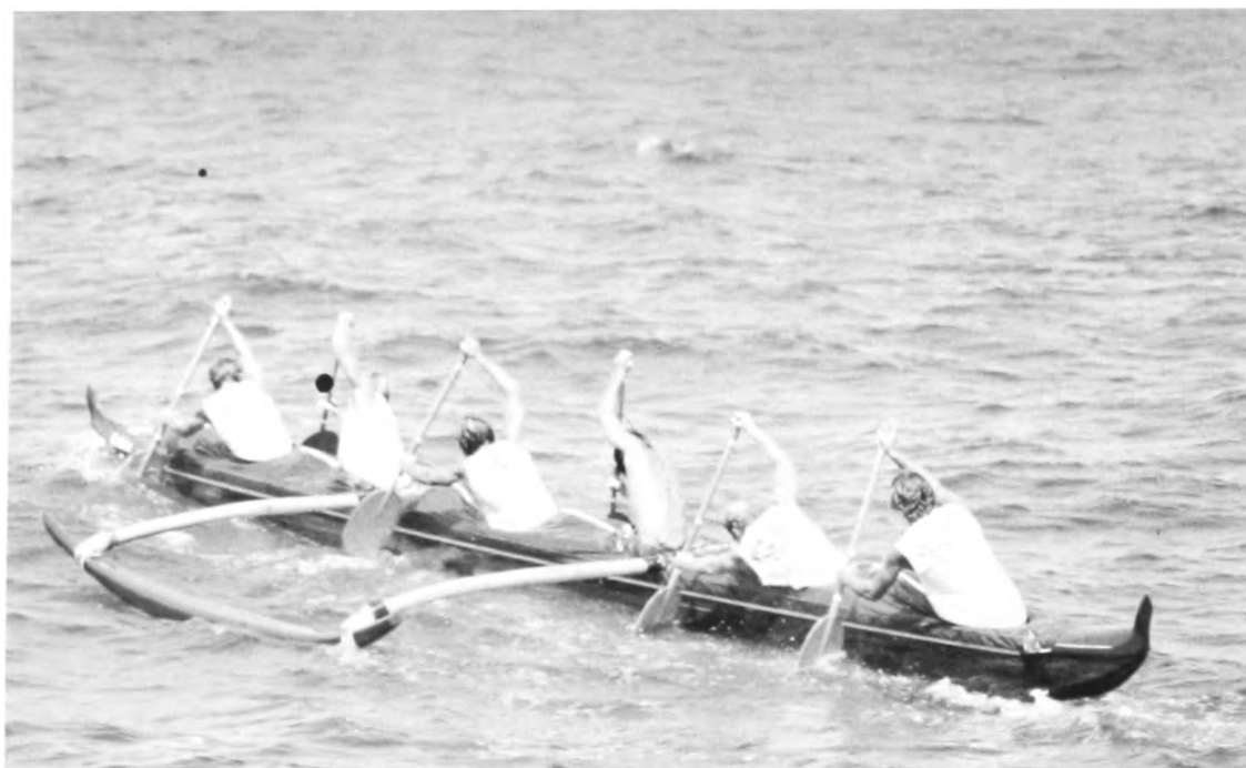
Outrigger crew in fine form midway across Molokai channel.