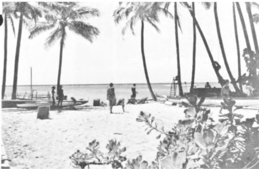
The sand court

New Outrigger Club Souvenir Postcards now available