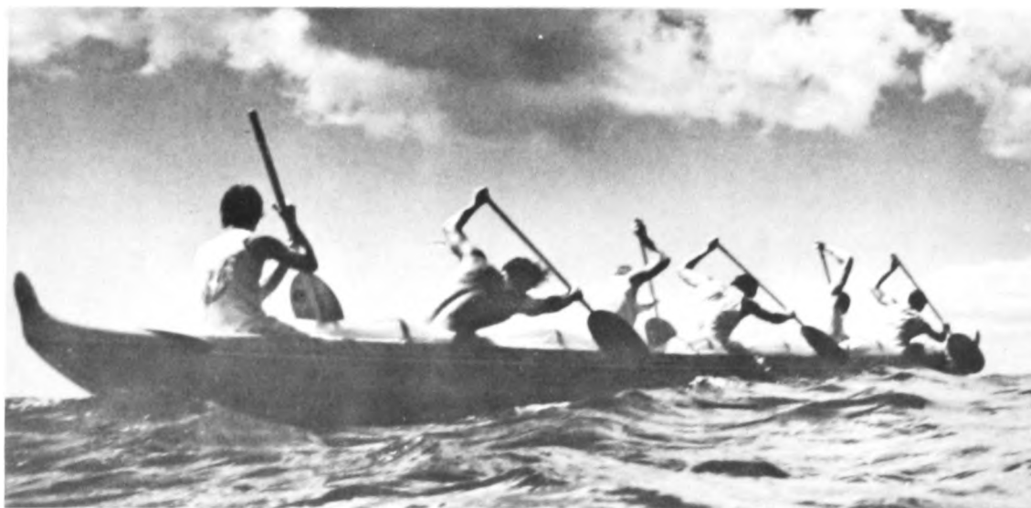
In mid-channel on a windless day, Outrigger's Molokai/Oahu race crew digs in to keep pace with Hui Nalu and try to overtake the eventual winners representing Healani.

The race started exactly at 7:30 a.m., the appointed hour, a blast of dynamite signaling the start. The first leg was to Laau Point, about two miles up the Molokai coast line, and each crew was striving to reach the point first, since it was where crew changing could commence. We arrived at the point neck and neck with Healani and Hui