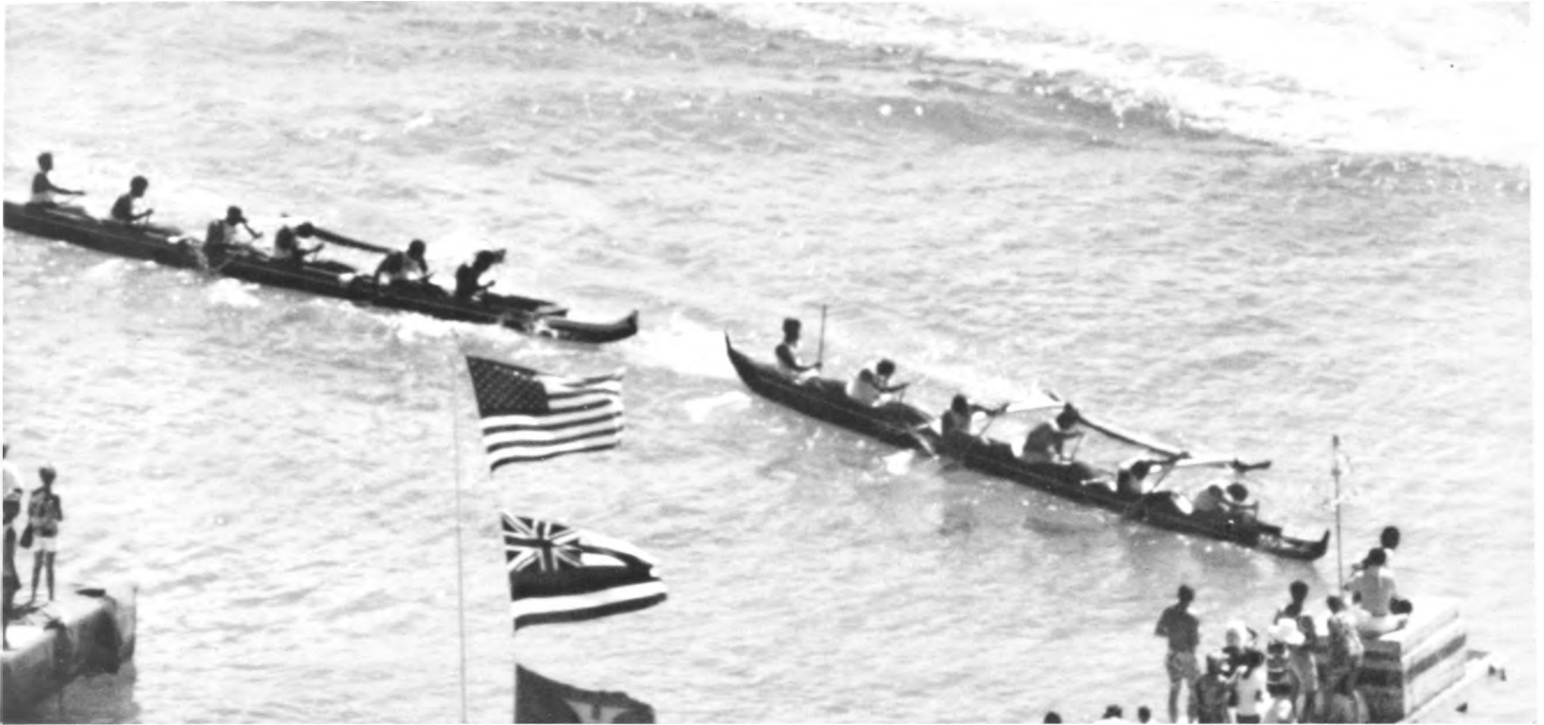
In one of the closest and most exciting finishes in the entire history of the Molokai/Oahu canoe racing classic, the Outrigger crew nosed out their old rivals, Hui Nalu by a scant canoe-length.