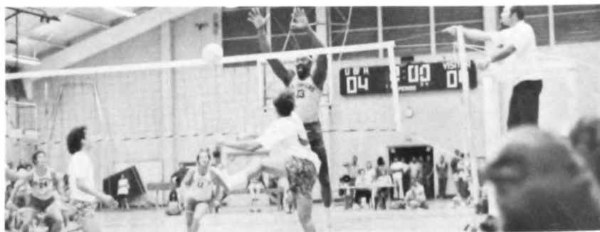
Nick's Fishmarket vs. Wilt the Stilt (story on page 6)