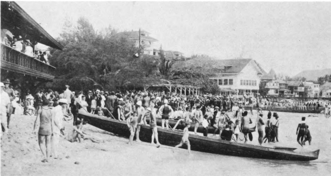
How it was in the Old Days around 1915. On the left, one corner of the Outrigger's dance pavilion. On the right, the Moana Hotel.