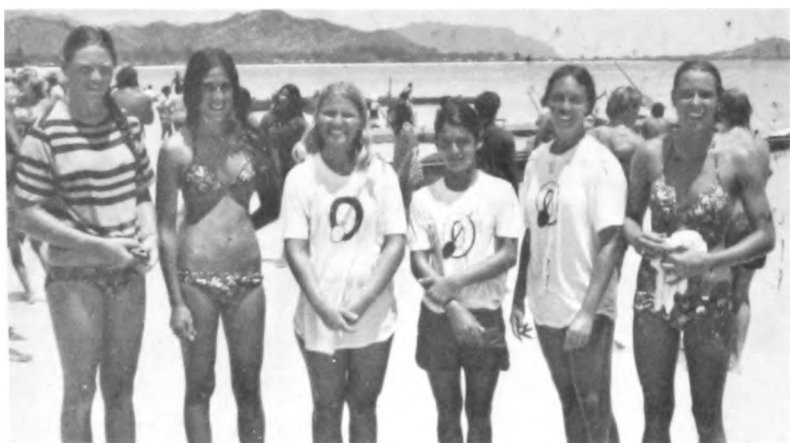
(above) Women Novice A