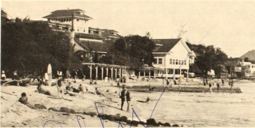
The Club's beach and Moana Hotel, circa 1908.

Presses will roll following official approval of text and illustrations