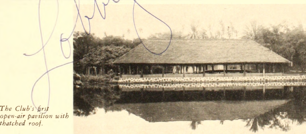
The Club's first open-air pavilion with thatched roof.

The photos reproduced in the adjoining columns are not among those selected for inclusion in the History, but they may help to convey some idea of the type of illustrations that will be used, all portraying a Honolulu, a Waikiki and an Outrigger Canoe Club of another era. They will be supplemented by fifteen or twenty full color illustrations of the modern Club in a special section of the book devoted to the Club we all know—the Outrigger Canoe Club on Outrigger Beach at Diamond Head.