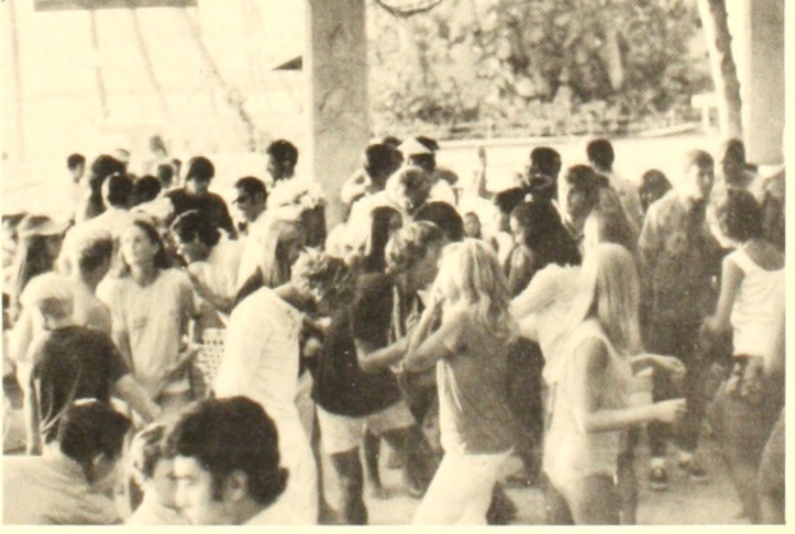
Part of Transpac bash on Hau Terrace.