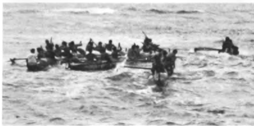
The Kauai Race start