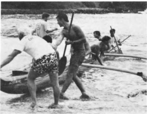
The finish at Kalapaki Beach 1 hour 40 Minutes later.