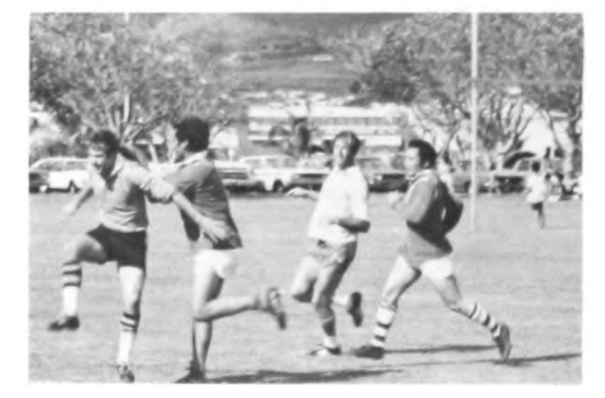
Action at Keebi Lagoon.