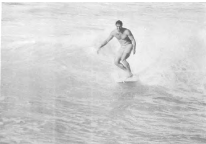
Fred Hemmings, Jr.