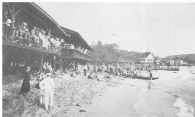
Duke Kahanamoku and the Outrigger Canoe Club he knew so well in his youth.