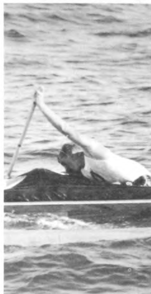
Jody D'Enbeau paddling