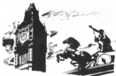
London, Great Britain