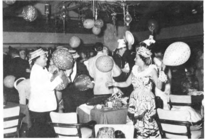
A happy, happy New Year.