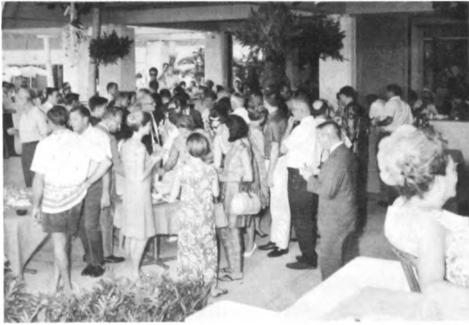
A merry, merry Christmas.