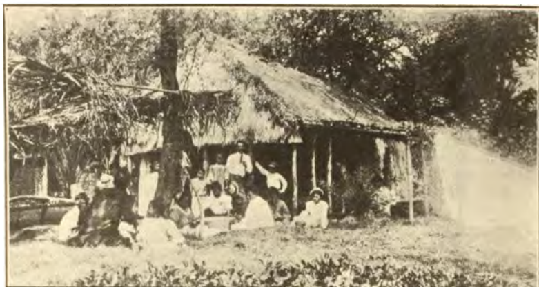
Native Day at the Outrigger Club.

In the way far back days OCC celebrated Native Day at the club each July 4th. Non-members were invited to spend a day of relaxation at the "clubhouse" and have themselves a real picnic. As the years went on this affair became a more and more important event as the visitors took to preparing an entire luau right at the site. And it sometimes took longer than one day to wind up Native Day at the club. Work? Who gotta go work? Not me. Take two . . . three days off. Thass OK.