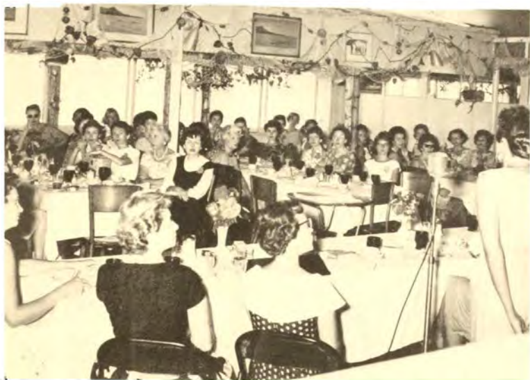
group of 58 Navy wives held one of their regular luncheon meetings at OCC on March 16th and from all appearances a real good time was had by all.