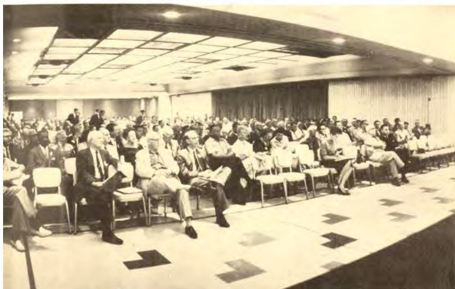
Showing a portion of the membership that attended the Annual Meeting at the Princess Kaiulani Hotel.