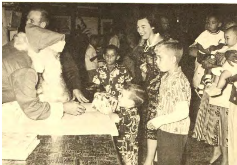
Santa had presents for all the young folks at the highly successful Christmas Kerki Party, December 16. Santa arrived by outrigger on a beautiful night.