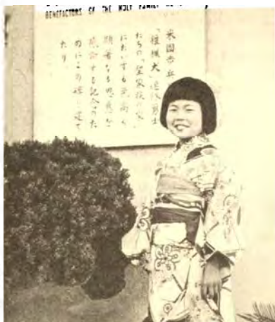
"The Little Princess"