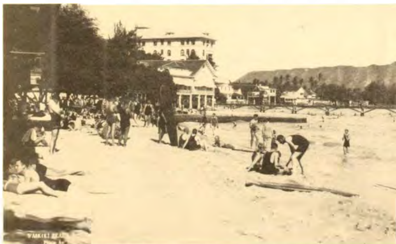
WAIKIKI, 1927—Many will remember this scene, taken in front of the Outrigger at the height of the roaring '20's. Still intact is the old Moana pier . . . and will you look at those famous Moana bathing suits!