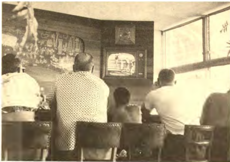
They're football fans through and through, no matter what age. This is just part of the crowd that lined the Outrigger Bar to witness the Bowl Games over television.