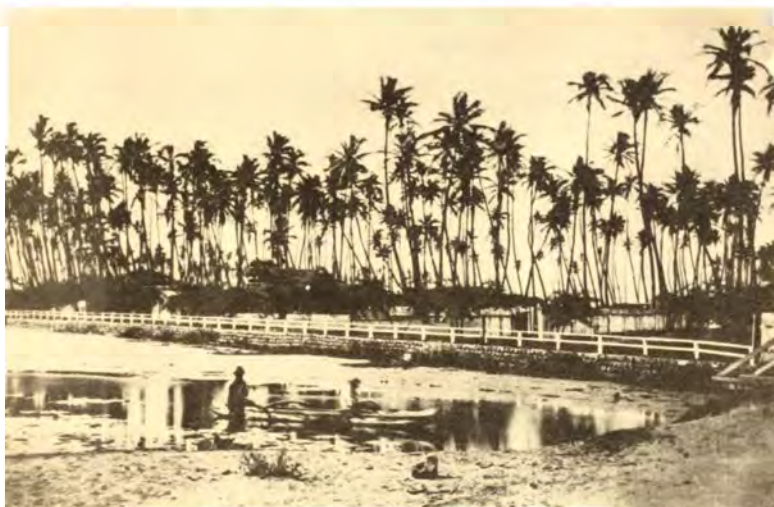
WAIKIKI, 1868—Bearing little or no resemblance to the shoreline that now exists for one of the world's greatest tourist centers, this is Waikiki—marshy and palm-lined.