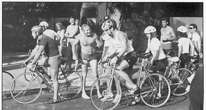
Bikers line up on Kalakaua in front of the Club waiting for their swimmer to finish the Castle Swim.