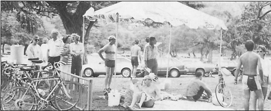
The median strip in front of the Club was the starting and finishing point for the bikers and runners.