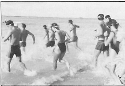
Swimmers hit the water at the start of the first event of the Triathlon — the Castle Swim.