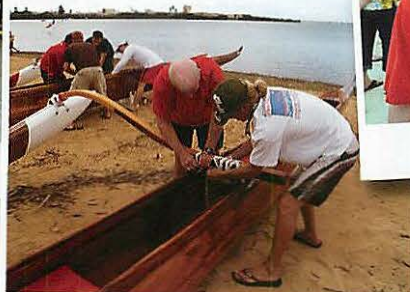
Members rig the OCC canoes Kaoloa and Kakina.