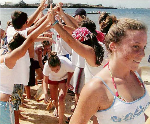
Winning the first race of the regatta for Outrigger were the Girls 14s, who are greeted with a victory tunnel.

Summer officially arrives for Outrigger Canoe Club members on the first Sunday of June every year when the Oahu Hawaiian Canoe Racing Association Regatta season opens. This year's Clement D. Paia Regatta on June 1, brought hundreds of members to Keehi Lagoon for the 37-event regatta, which features races for paddlers from age 12 to 55+.