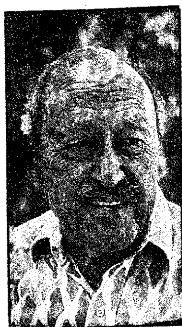
Vladimir Ossipoff Honolulu architect