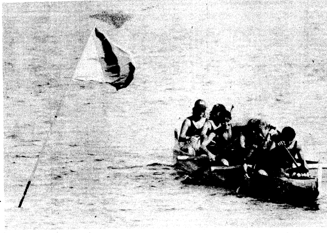
Lahaina Canoe Club's junior women crew paddles home with an impressive victory over Outrigger Canoe Club at state regatta