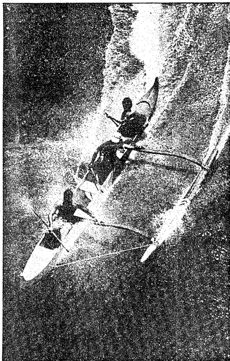
Warren Bolster aerial photo