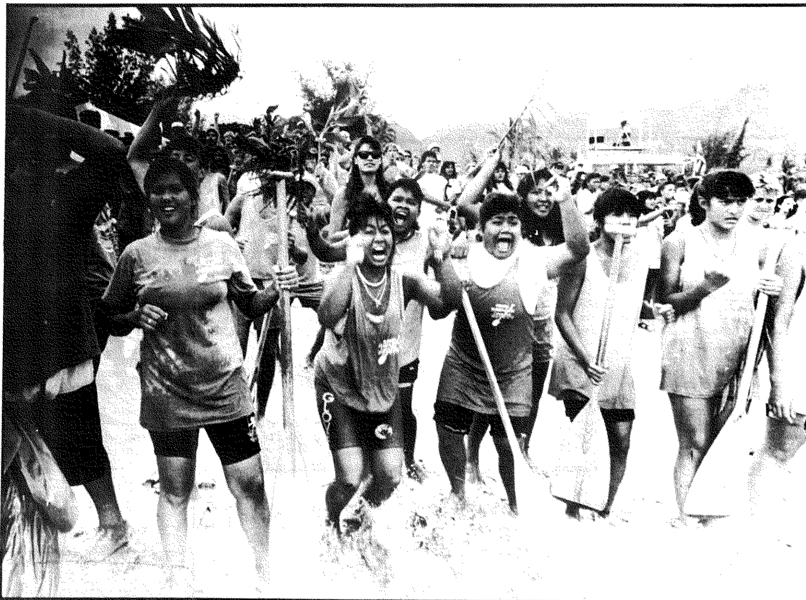
MAUFS HAWAIIAN CANOE CLUB members anxiously encourage their team on to victory.

The event was organized and conducted by members of the Hawaiian Canoe Racing Association and hosted by the Garden Island Canoe Racing Association.