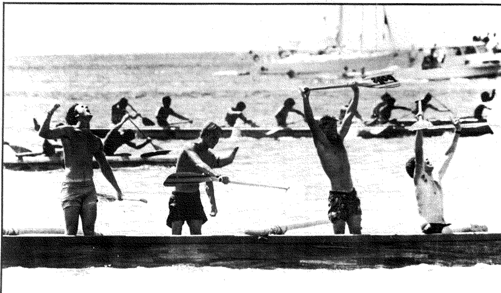
TEAM SPIRIT, SUNSHINE, AND ALOHA were plentiful at Hanalei Bay on Saturday during the 40th annual state championship canoe regatta.