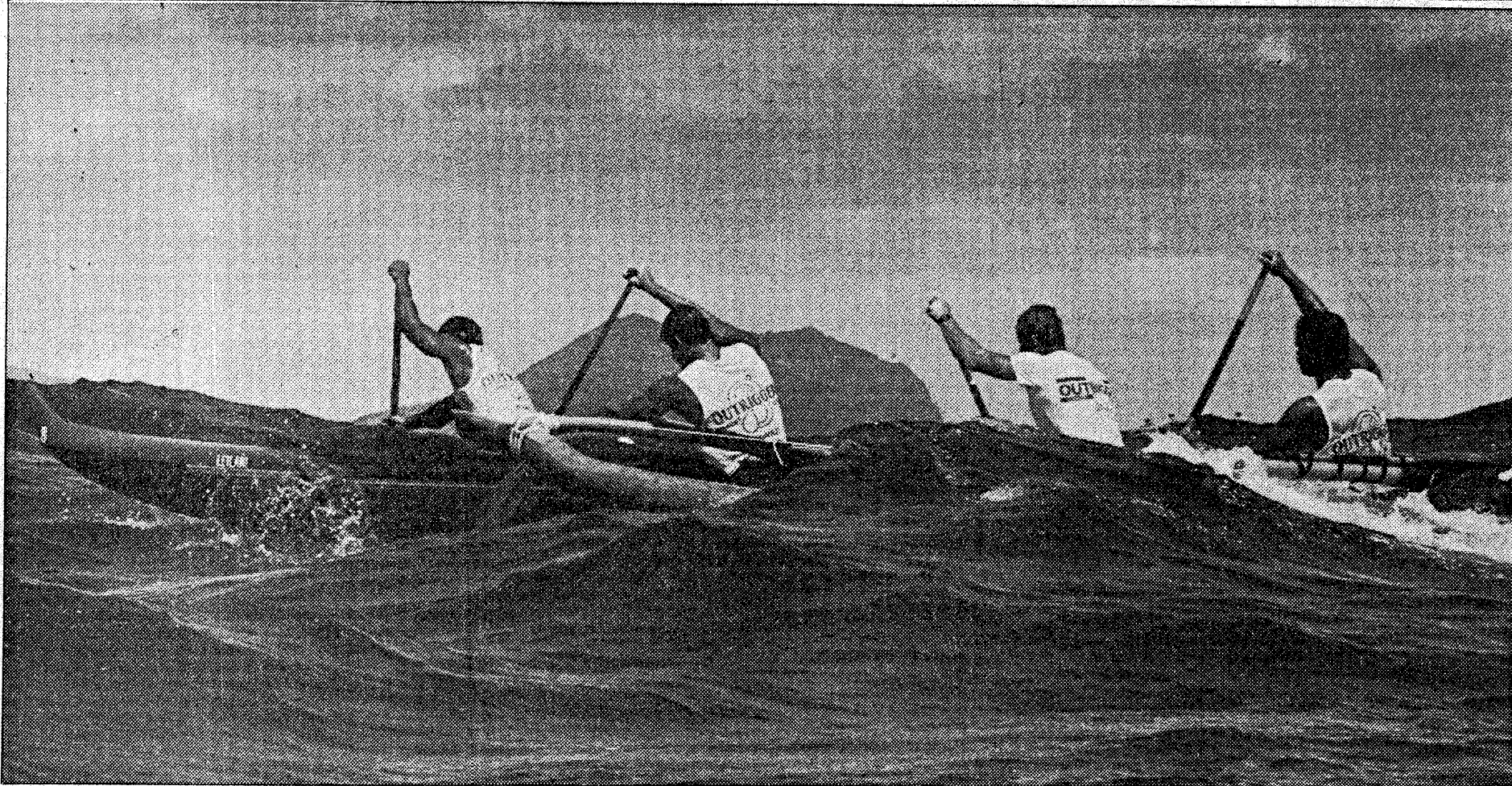
Outrigger Canoe Club's No. 1 crew has a swell time in Kaiwi Channel.