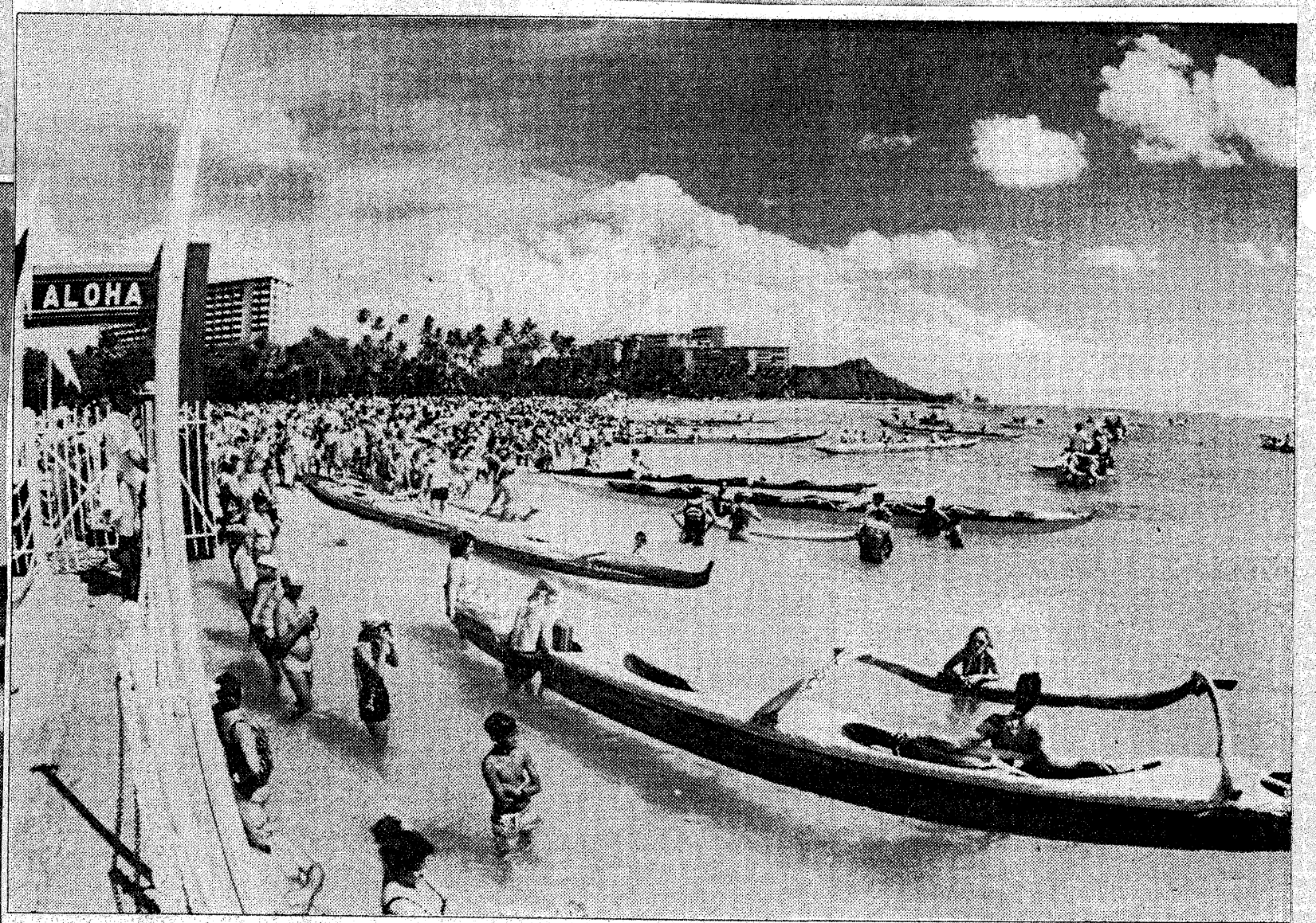
The canoe capital of the world, at least for a day: the finish line at Fort DeRussy Beach.