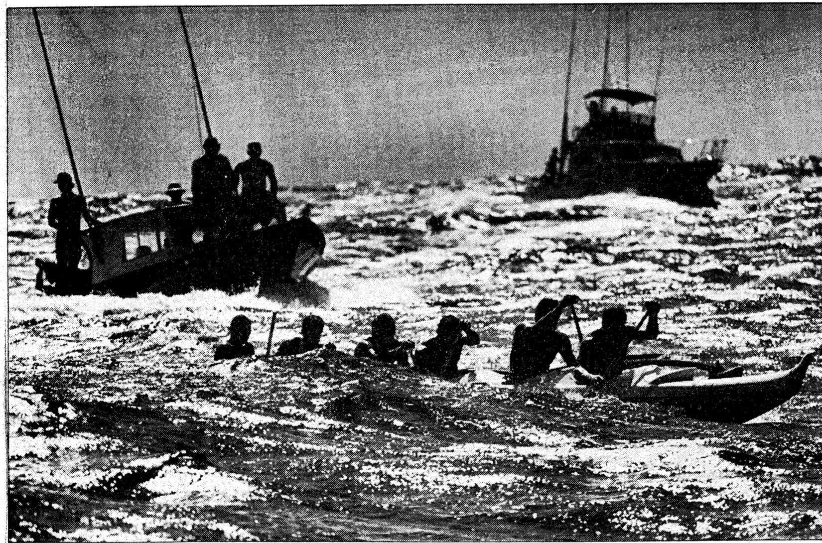
STROKE FOLK —Tahiti's FFPP 1 team is partially hidden by a swell during yesterday's Moloka'i Hoe. The Tahitians led most of the 40.8-mile race before finishing second to Illinois Brigade 1.