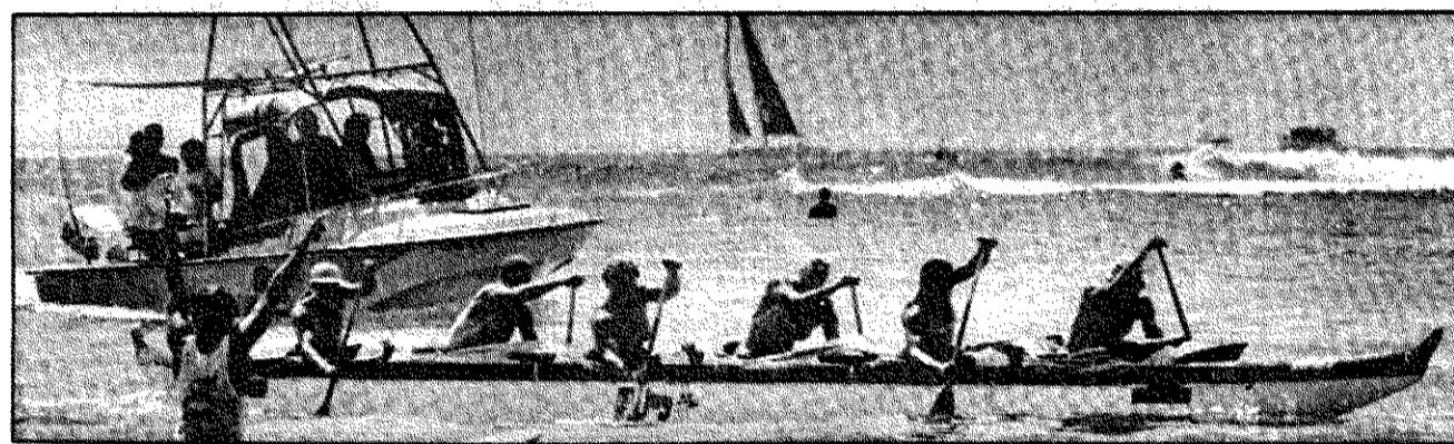
Offshore of California (top left) paddles past the Diamond Head Lighthouse en route to the finish line at Duke Kahanamoku Beach in the Na Wahine O Ke Kai race. Offshore, with a support boat nearby, heads for shore with victory in hand.