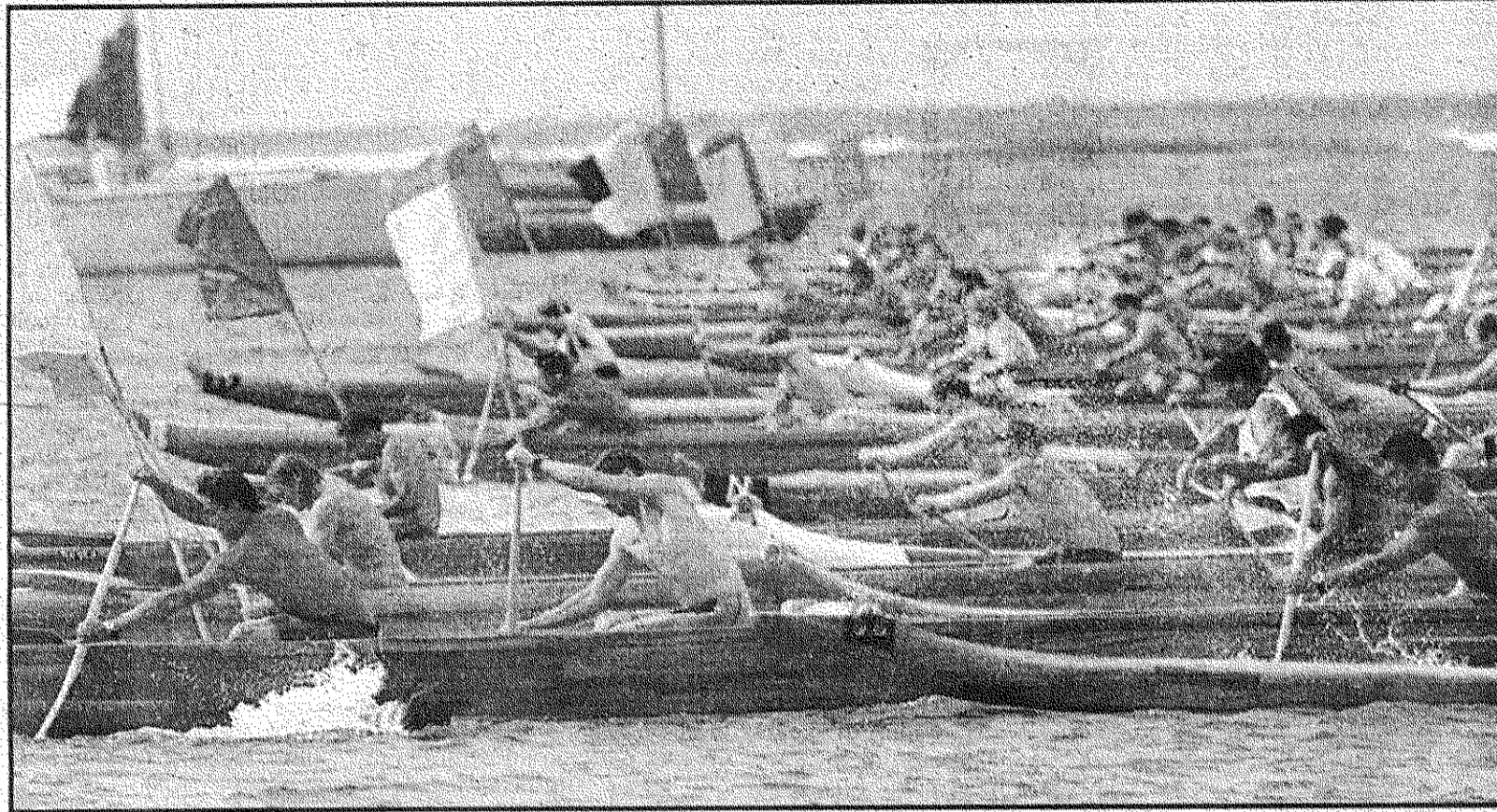
Gentlemen start their paddling during the start of the men's open race during yesterday's state canoe championship at Hanalei Bay.

Later, Lokahi would make See Outrigger, Page C5