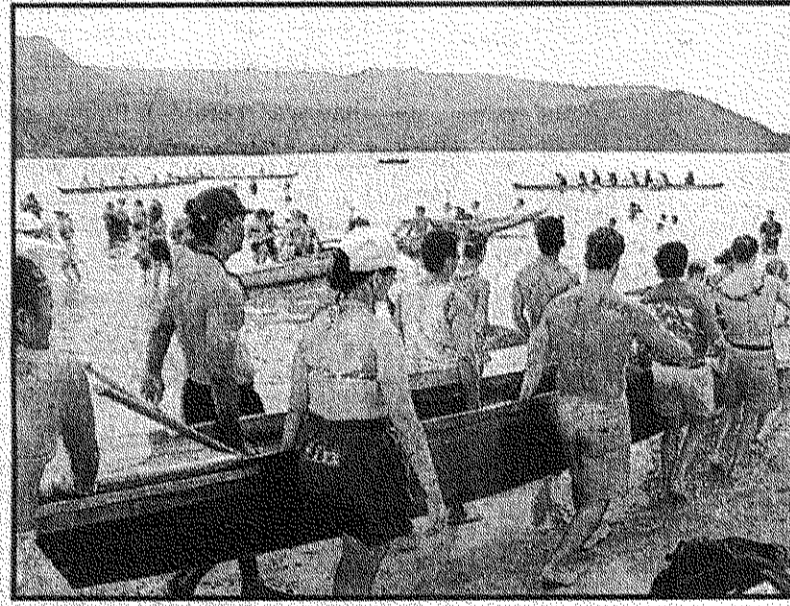
Paddlers head to the starting line with their canoes.

After hitting the turn even with several clubs in the half-mile race, Outrigger pulled away down the stretch for the win.