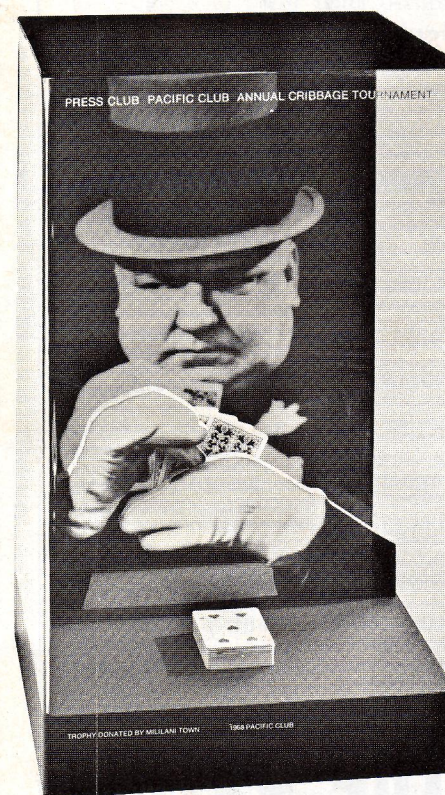
This is new trophy to be awarded at annual tourney between Press and Pacific Clubs.

"OLD AGE AND treachery will overcome youth and skill."