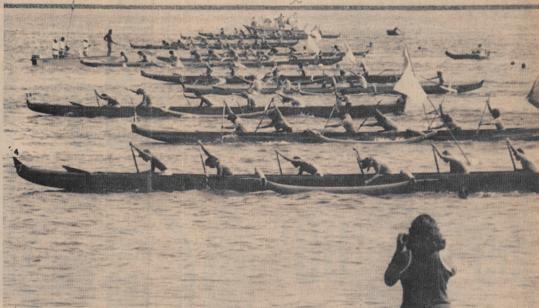
BY LAND AND BY SEA—Action was heavy on the seashore and sea lanes of Hilo Bay Saturday as 31 of the state's canoe clubs gathered for the HCRA's State Championship

Regatta. More than 2,000 paddlers competed and some 7,000 fans lined the bay to watch and cheer. Kauai's Hanalei Canoe Club took the crown after a tight finish.