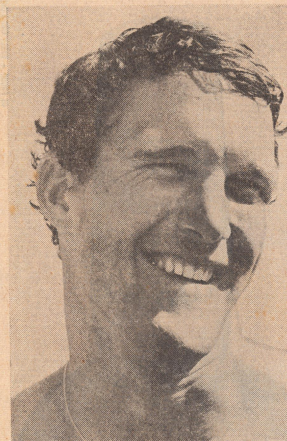
Fred Hemmings nosed out Midget Farrelly of Australia on eighth wave to win the world surfing championship at Puerto Rico yesterday.