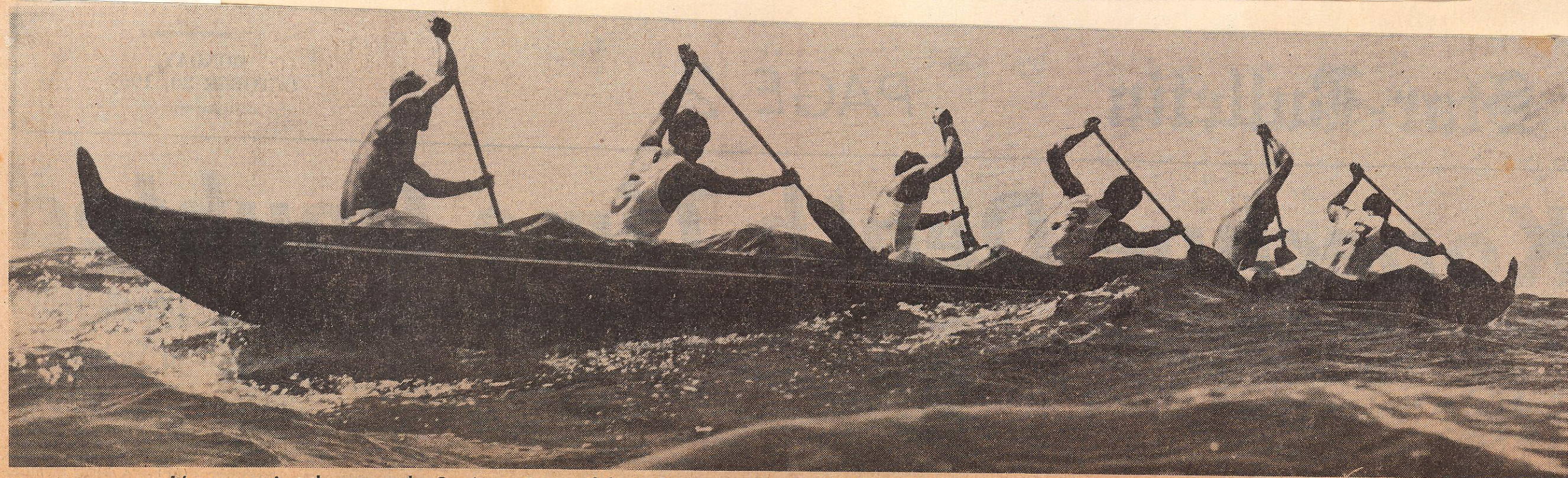
It's men against the sea as the Outrigger Canoe Club's Kakina is paddled in the Molokai-Oahu canoe race. Story on B-1.